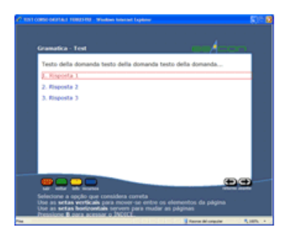
Figure 7. Example of an exercise.