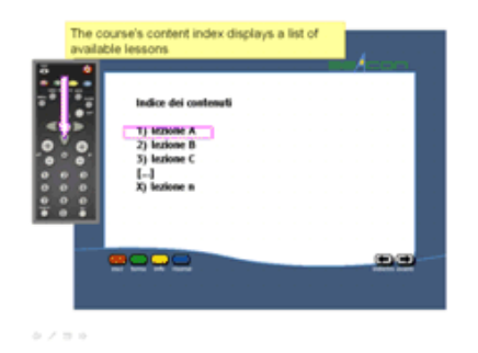
Figure 5. Index of contents