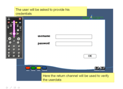
Figure 3. Log-in