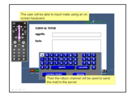
Figure 8. Example of the interaction with tutor.