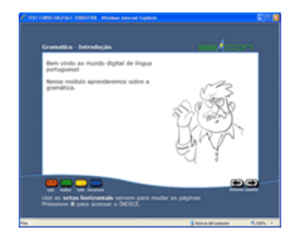
Figure 6. Example of a page course