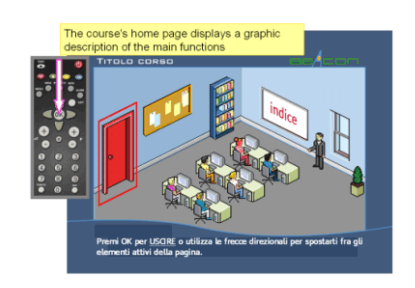
Figure 4. Home page