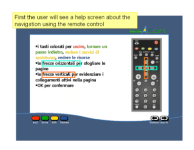
Figure 1. The access to courses

The following figures are an example of a friendly and simple prototype of user interface studied for the BEACON project.